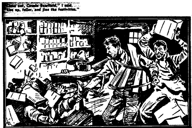
"The Riot at Cougar Paw" Action Stories , October 1935