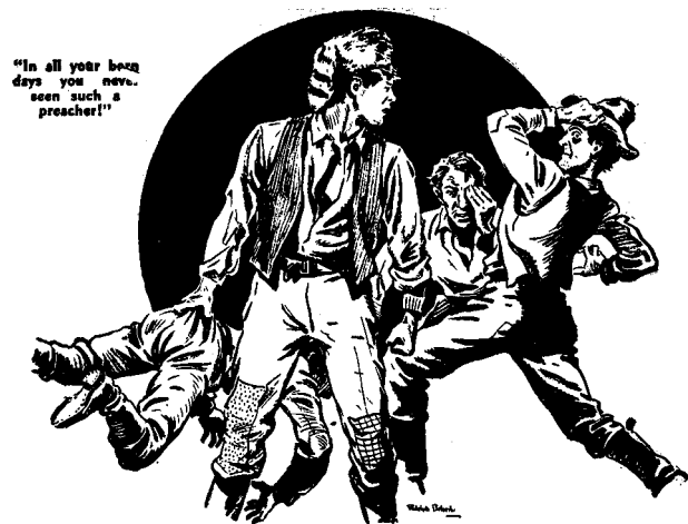
"Cupid from Bear Creek" Action Stories , August 1935