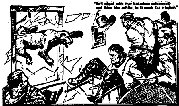
"The Feud Buster" Action Stories , June 1935